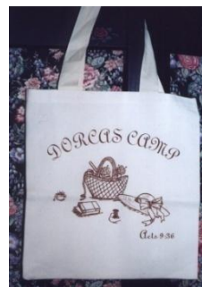
Dorcas Canvas Tote